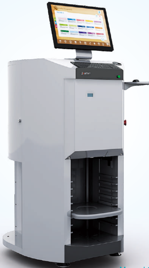
Manual Can Table Version