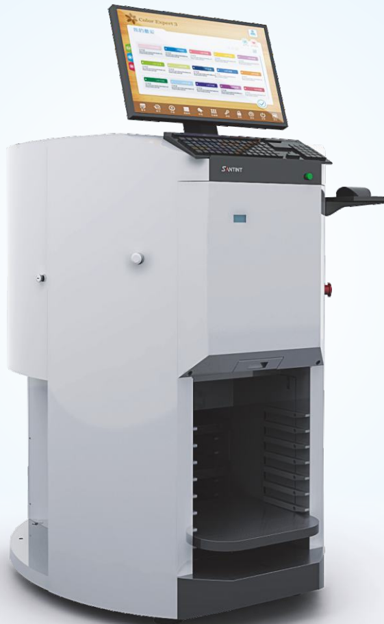
● Manual Can Table Version