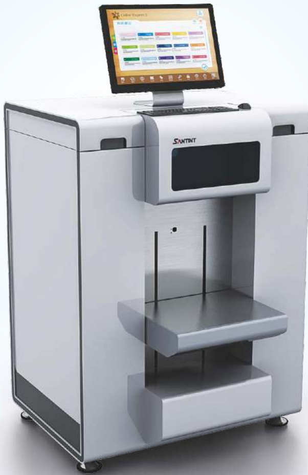
● Electrical Can Table Version